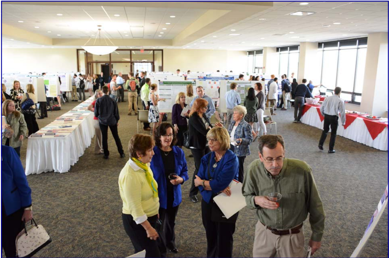
Celebration of Scholarly Achievement 2016.